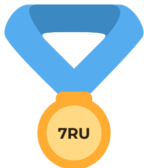
Year 7 winner

Congratulations to the Tutor Groups with the most merits and the top-scoring students in each year group. Well done, everyone!