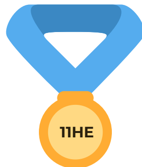
Year 11 winner