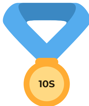
Year 10 winner