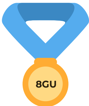
Year 8 winner