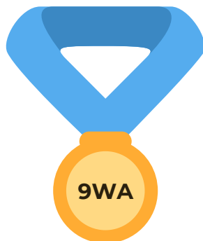
Year 9 winner