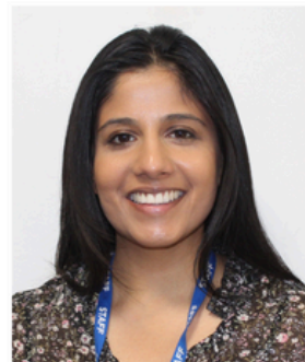
Miss Lallian Safeguarding team